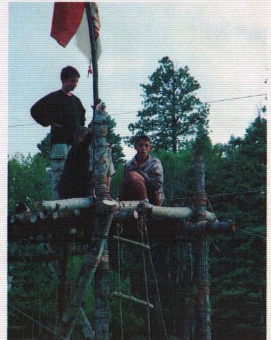
"THE TOWER" LONG TERM 2004